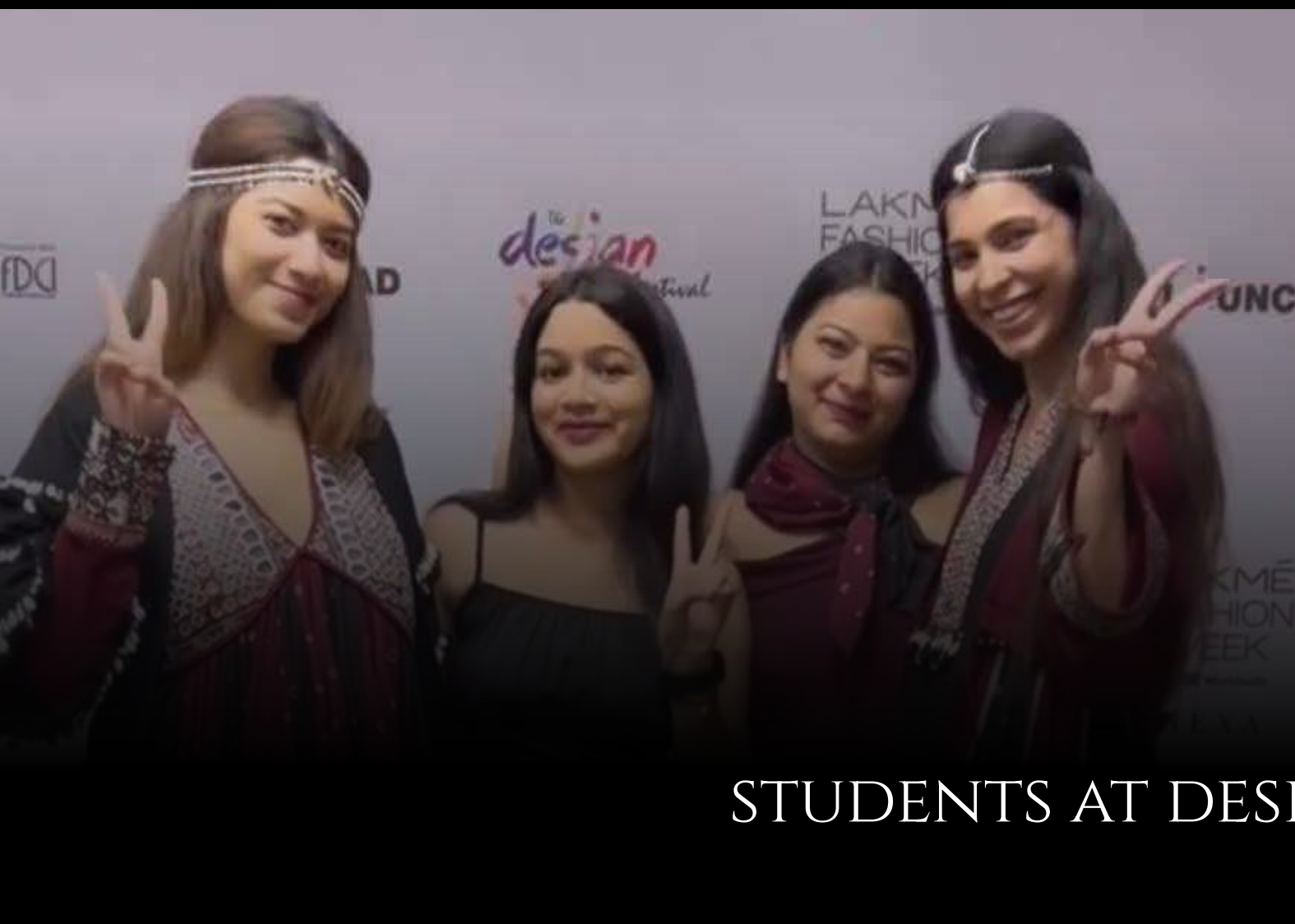
STUDENTS AT DESIGN COMPETITION