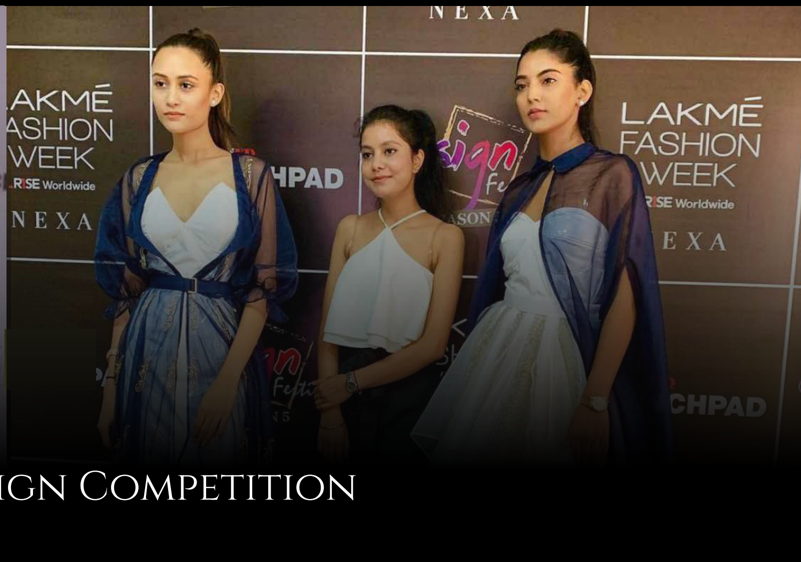
STUDENTS AT DESIGN COMPETITION