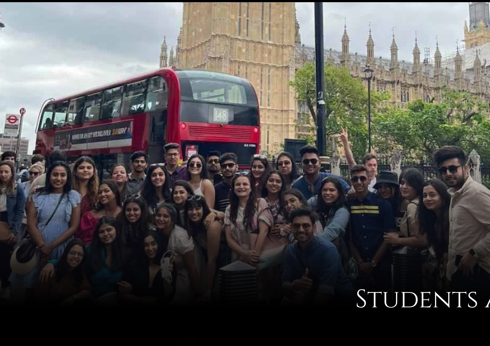
STUDENTS AT LONDON