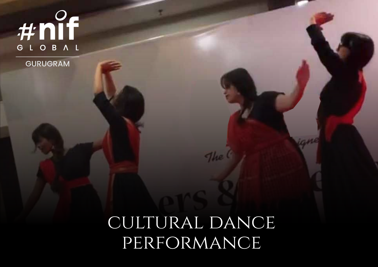
CULTURAL DANCE PERFORMANCE