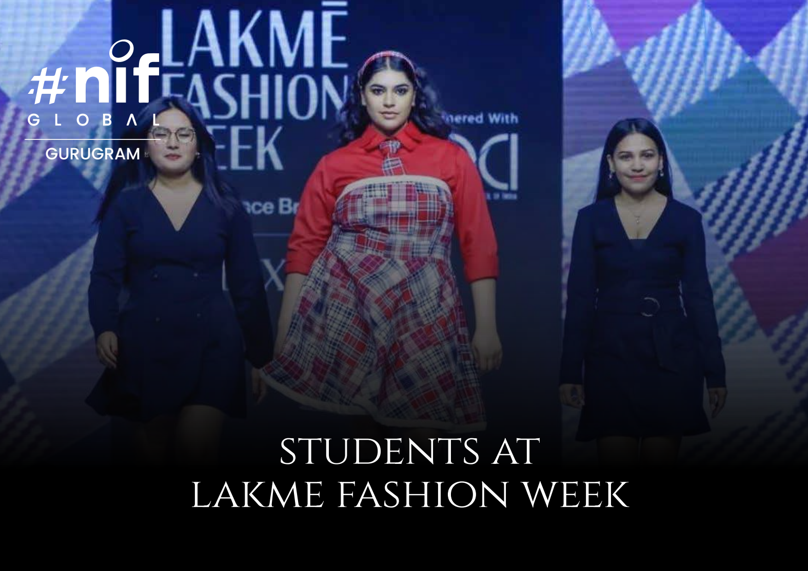
STUDENTS AT LAKME FASHION WEEK