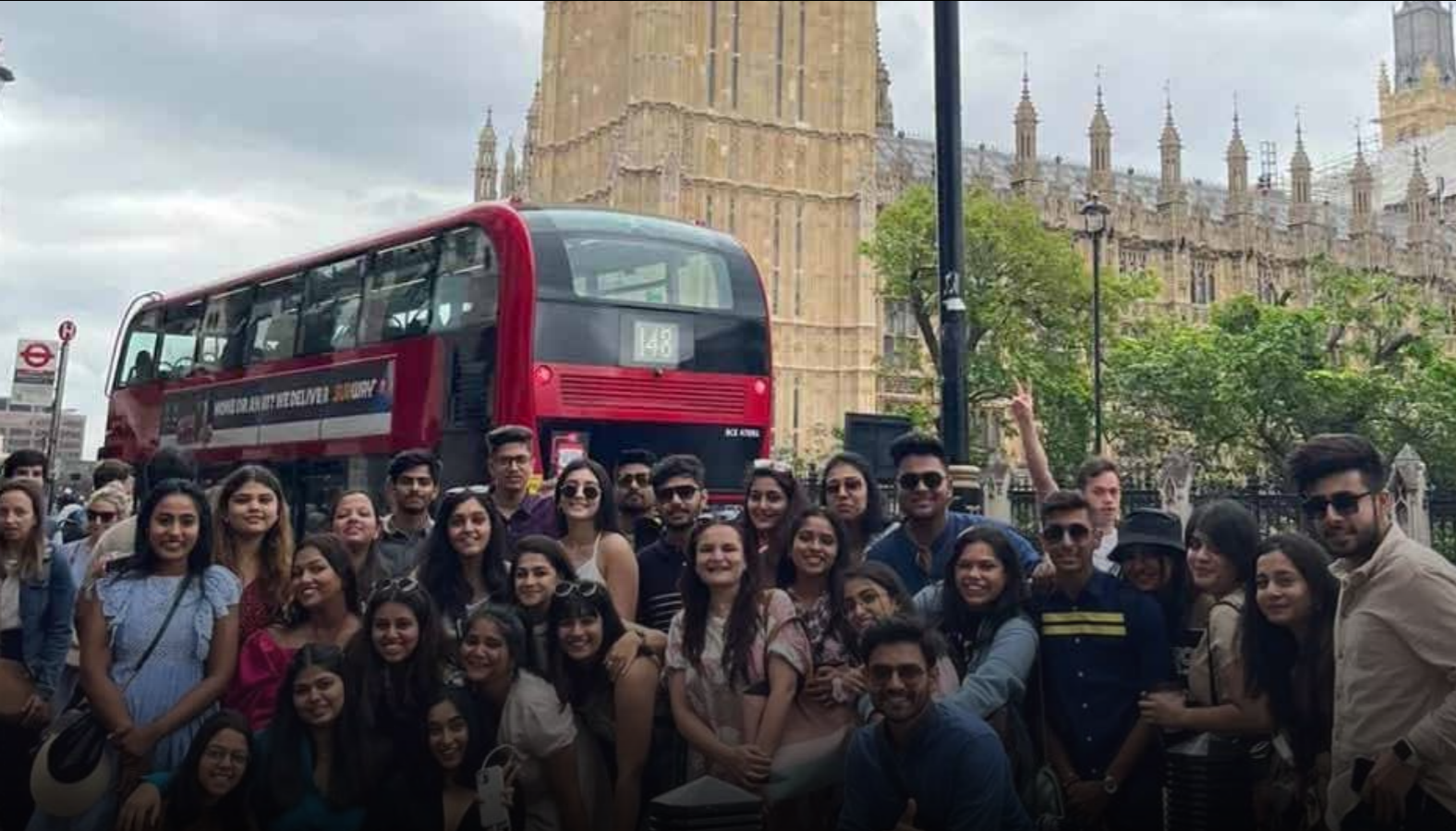
STUDENTS AT LONDON